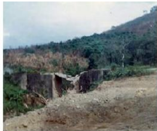
"Destroyed bridge, at time of shooting, Hightway 9, approximately 5 miles SW of Khe Sahn, August, 1967"

system mounted on a rotating platform, I think common on all convoys of the time. Suddenly as we moved downward to a blasted out bridge (pictured,) this thing started firing, and firing some more at something to the south. The fire went on for some time. Earlier, I was told that there had been a serious ambush a couple of weeks before and the gunners were jumpy. At this time, all drivers were told to pile out and take cover (see map--this happened at point where Hwy 9 crosses river 5 miles SE of Khe Sahn Comat Base, at photo above.) We just waited for whatever was to happen. As it turns out, there was no return fire—none. Those guys on that quad-50 had surely seen something with their sustained fire but whatever it was, it went underground quickly and silently.