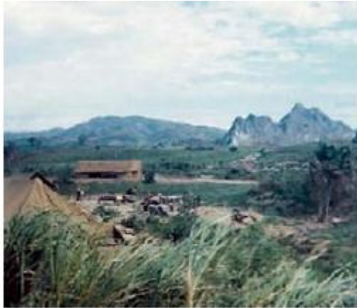
"Rockpile ridge approximately halfway between Dong Ha and Khe Sahn, August, 1967"

resupply our squad-tent club (the beer would never had made it to the club without someone with a gun riding along with it.)